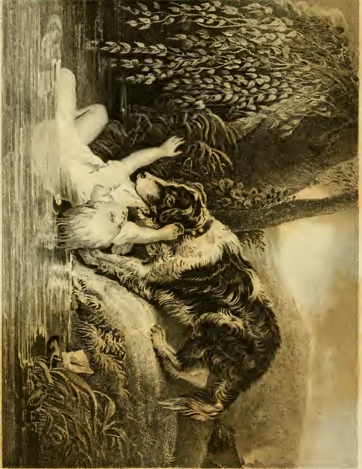
WILSON'S ILLUSTRATED MAGAZINE, 1857